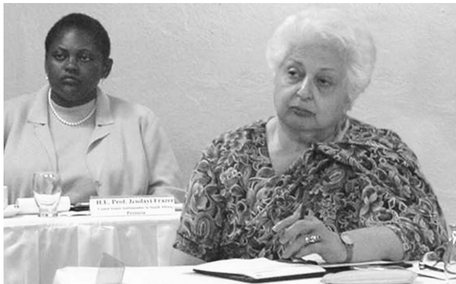
Prof Jendayi Frazer, left, US Ambassador to South Africa, and Dr Frene Ginwala, right, of the Global Coalition for Africa.

In serving as a watchdog over the public interest, civil society also acts as a vehicle for deepening democratic governance. In this role, civil society co-operates with, but sometimes opposes, government measures. Its input in shaping policy gives meaning to popular participation. One of the shortcomings of African governments has been the tendency to shelve good and well-conceived programmes. The contribution of civil society in this regard lies in its ability to pressure governments to follow through on policies to the implementation stage. Civil society's effective watchdog role can, for example, be critical in the way in which it ensures that the SADC Strategic Indicative Plan for the Organ on Politics, Defence and Security Co-operation (SIPO) is implemented.