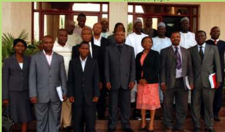
Group photograph of participants at a workshop on Research on Agricultural Funding in Abuja