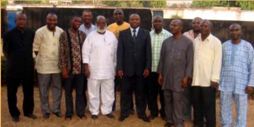
Members of the PTG pose for a group photograph

PTG, at this maiden meeting, had a brainstorming session on the challenges and implications of federal government budget proposal for 2010 especially on key issues including rationality for assumptions and targets, links of resource allocation priorities of the government as given by the Seven-Point Agenda, fiscal balance, adequacy of budget documentation, balance of capital-recurrent allocations, alignment of allocations to service delivery and alignment and global best fiscal and budget management principles and practices. The summary of the observations and recommendations of the Group was widely reported in the media.