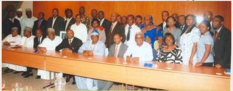
Participants at the Policy Seminar on the Fiscal Responsibility Act 2007, held at Transcorp Hilton in Abuja