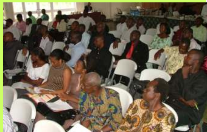
Cross section of participants at the event