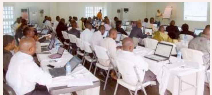
Participants during the course held in Enugu

The overall goal of the training was to increase skills, expertise and knowledge for the appreciation, use and application of multivariate techniques in social and economic analysis using the STATA and DASP software. This is keeping with the vision and mandate of the Institute in upgrading the analytical and research capacities of professionals engaged in social and economic processes of decision making in Nigeria and the African continent. Forty-seven (47) high and mid-level professionals from sixteen (16) organizations participated in the course which was rounded off with a cocktail party.