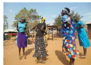
MUNDARI WOMEN DANCING IN THE OUTSKIRTS OF JUBA, SOUTH SUDAN.

“ In Ikotos, signs of peace among communities include youth dancing throughout the night, drinking from one calabash, and lorries carrying goods on the road. ”