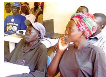
A COMMUNITY PEACE COMMITTEE MEETING IN KIDEPO VALLEY IN THE EASTERN EQUATORIAN REGION OF SOUTH SUDAN IN DECEMBER 2017.

“Those in peace committees are primarily driven by the desire to bring peace to their communities.”