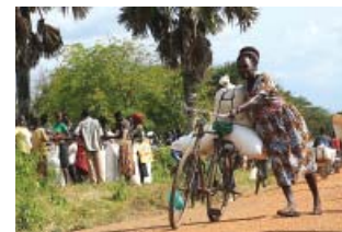
A REFUGEE FROM SOUTH SUDAN TRANSPORTS FOOD FOR DISTRIBUTION IN THE MOYO DISTRICT, NORTHERN UGANDA, IN OCTOBER 2017.

“The country remains the fastest-growing and largest refugee situation in Africa, with an estimated 3.1 million South Sudanese refugees projected to be hosted by six neighbouring countries by the end of 2018.”